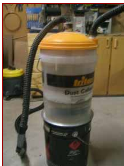
Ready to go, your home made cyclone

In photo 8, you can see the white ring around the top of the funnel. This is more gap filler which was added later to remove the ledge created by the large ring. It makes a gradual slope for the particles to slide down on rather than have them sitting on that ledge. Builders bog is a good filler