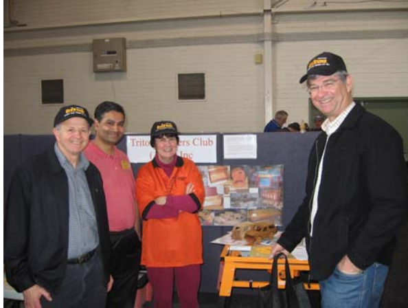
A Smiling Triton Team

able to show some of our member's efforts. We had many people stop and talk with our faithful members who staffed the stand and let's hope some of these people are now new members reading this article.