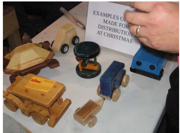
Toys any child would love

The photos show above some of our faithful workers, and the items we had on display. The committee's thanks goes to all those members who spared a few hours over the weekend to help staff our stand and talk with current and potential woodworkers.