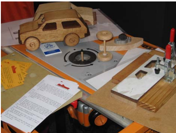
Jigs and cars and wheels and Triton